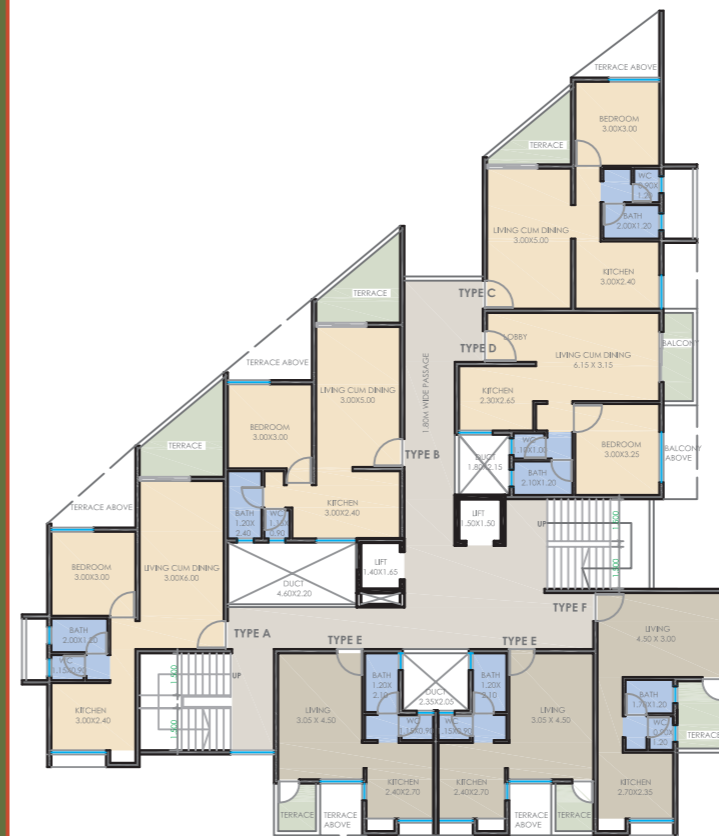
Typical - 1st, 3rd, 5th & 7th Floor Plan